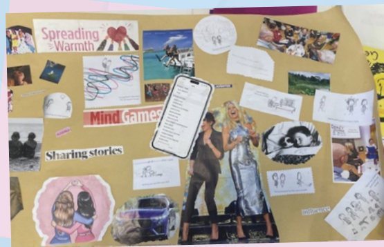
A photo of part of the Friendship collage made by the FFSP team November 2024 in Glasgow

A team of experts by experience, throughcare and aftercare staff and researchers worked together, using creative methods, to explore the importance of friendship for care experienced people and develop resources to improve practice.